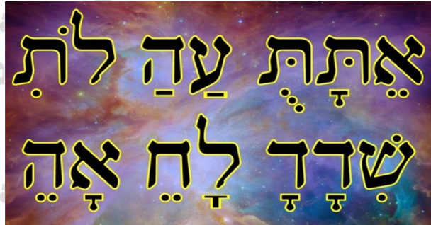
Ey'Tah'Tu'Ah'Ha'Lo'Tih and Shih'Dah'Dah'Lah'Heh'Ah'Heh

Hidden within the initial and final letters of this verse are two Holy Names that generate the spiritual power that ignites the fires of the heart for Divine service. These Holy Names are made up from the initial letters and the end letters. The vowels are those of the verse, when applicable and the basic vowel is added when needed. Thus the Holy Names are: